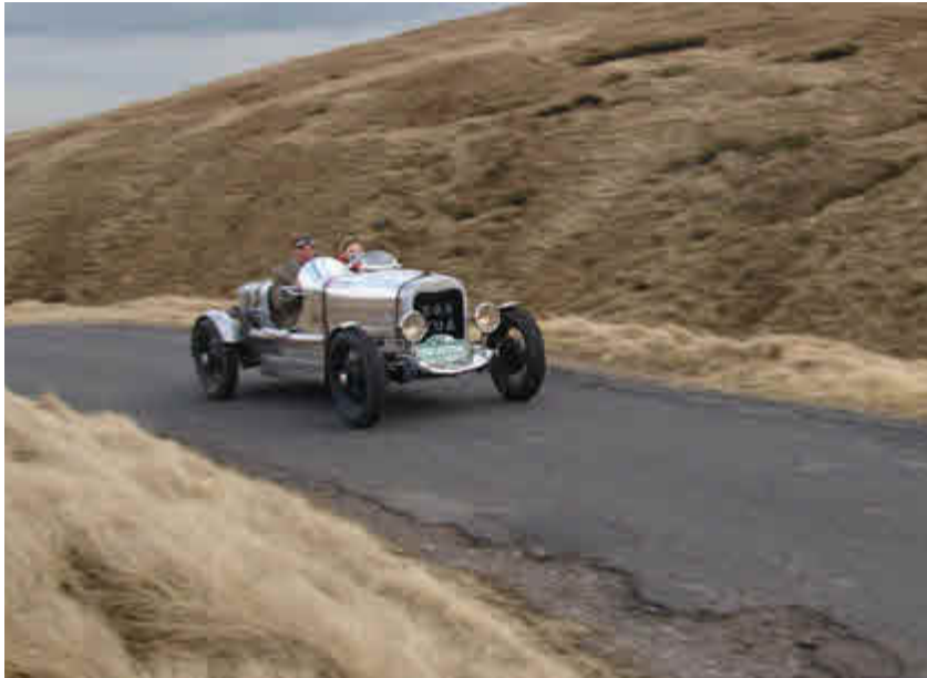
Cousins Matt and Claire Abrey in a Ford Model A special.