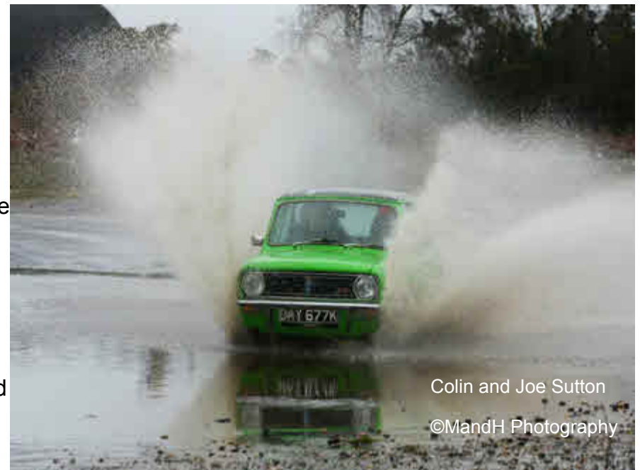
Colin and Joe Sutton

Now for the flyers that didn't quite get the result they could have Piotr Kozimor Citroen C2 had FOUR QUICKEST , and a disputed line fault (!) but was held to 6th due to poor times on tests 1,6 & 15. Tomasz Marciniak Honda S2000 also 4 quickest times but new navigator Radek struggled a little with the maps but 8th still good. Ben Griffin 106 Rallye had 3 fastest times and lots of other top times but a Maximum on test 1 and some other inconsistent tests on the first loop placed him 14th.